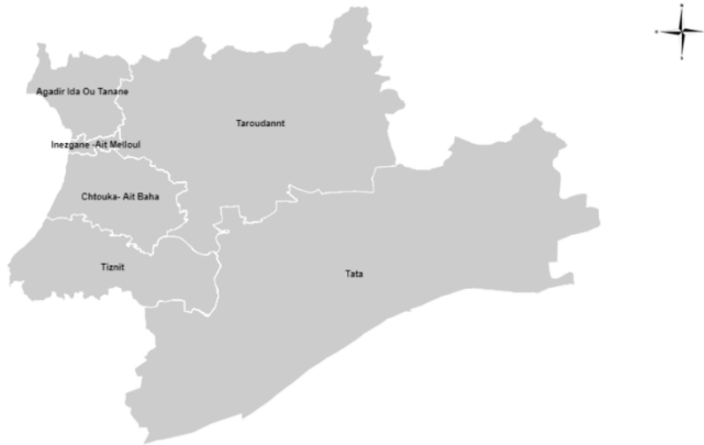
Fig. 1 Administrative Division of the Souss Massa RDHCP

Tiznit, Tata, and Chtouka Aït Baha. Its capital is the prefecture of Agadir-Ida-Ou-Tanane (Decree No. 2-15-40 of February 20, 2015, establishing the number of regions, their names, and their capital cities).